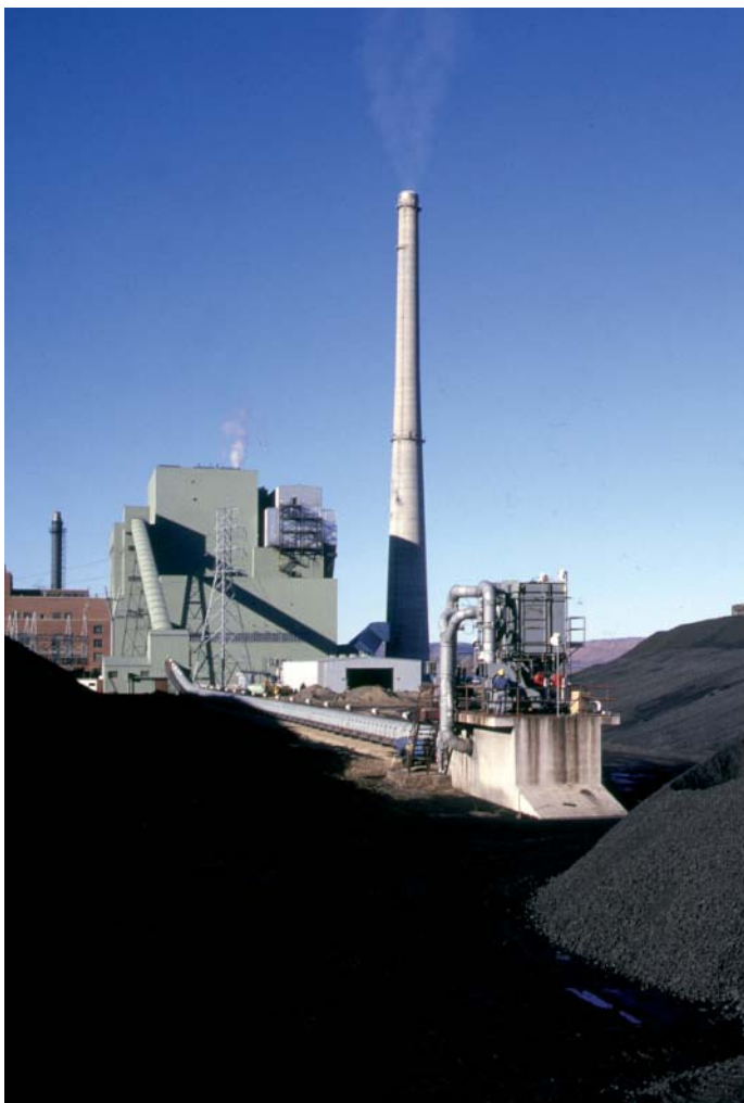
Our experience and expertise allows us to develop and implement a combustion improvement project from start to finish.